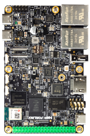
i.MX application processors